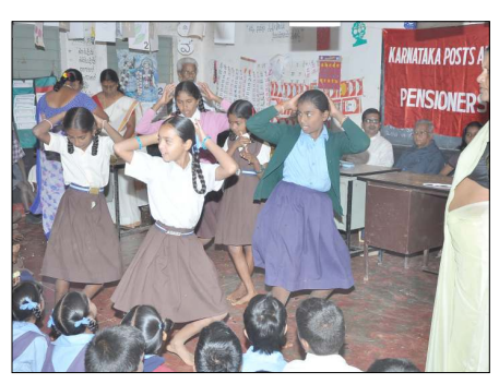
Group dance by the students