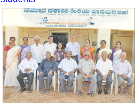
Representatives of K P&T PA with the H \overline{\text{M \& Teachers}}